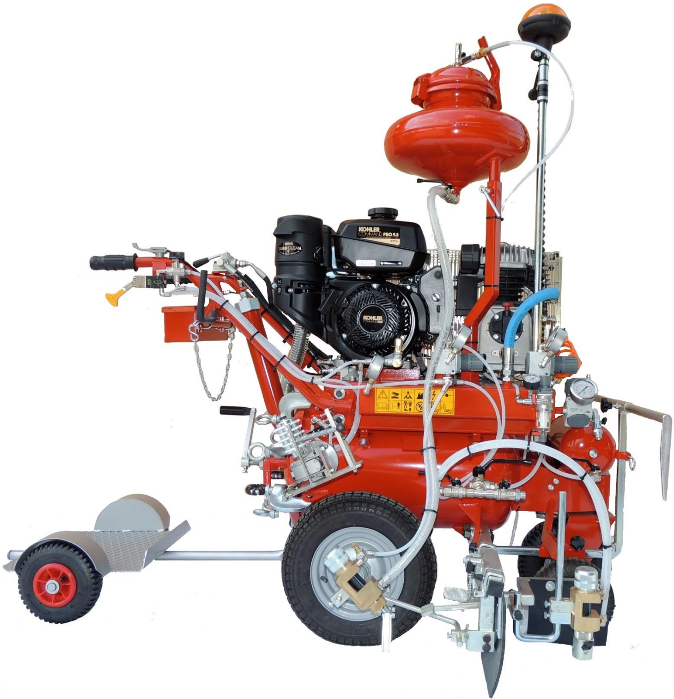
Photo doesn't show standard machine